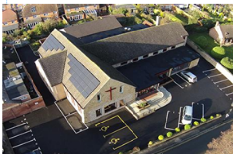
Visible above: building now all under one roof, solar panels, better disabled parking and access ramp, welcoming facade, attractive planting etc.

For most of us, I think, it was a revelation and an achievement of which the church can be extremely proud.